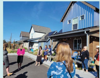
Above Left: People of Color Caucus meeting attendees. Middle: City officials exploring the trade show. Right: Housing Tour

We were disappointed by low attendance at the workshop on diversity, equity and inclusion and have since and continue to discuss how to help mayors and councilors throughout Oregon understand how important it is for all of us to improve our knowledge and our practices. Work continues.