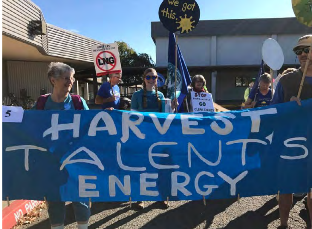
Above: Rogue Climate Talent at the Talent Harvest Festival spreading awareness of the Talent Clean Energy Action Plan.

With grant funding, the city hired a staff person to convene community stakeholders. The 18-month public engagement process included online surveys, technical advisory groups involving about 100 people who held eight public meetings on four subject matters, and targeted outreach to underrepresented community members. The outreach generated 350 potential actions the city could take, a list that narrowed through community meetings and online surveys.