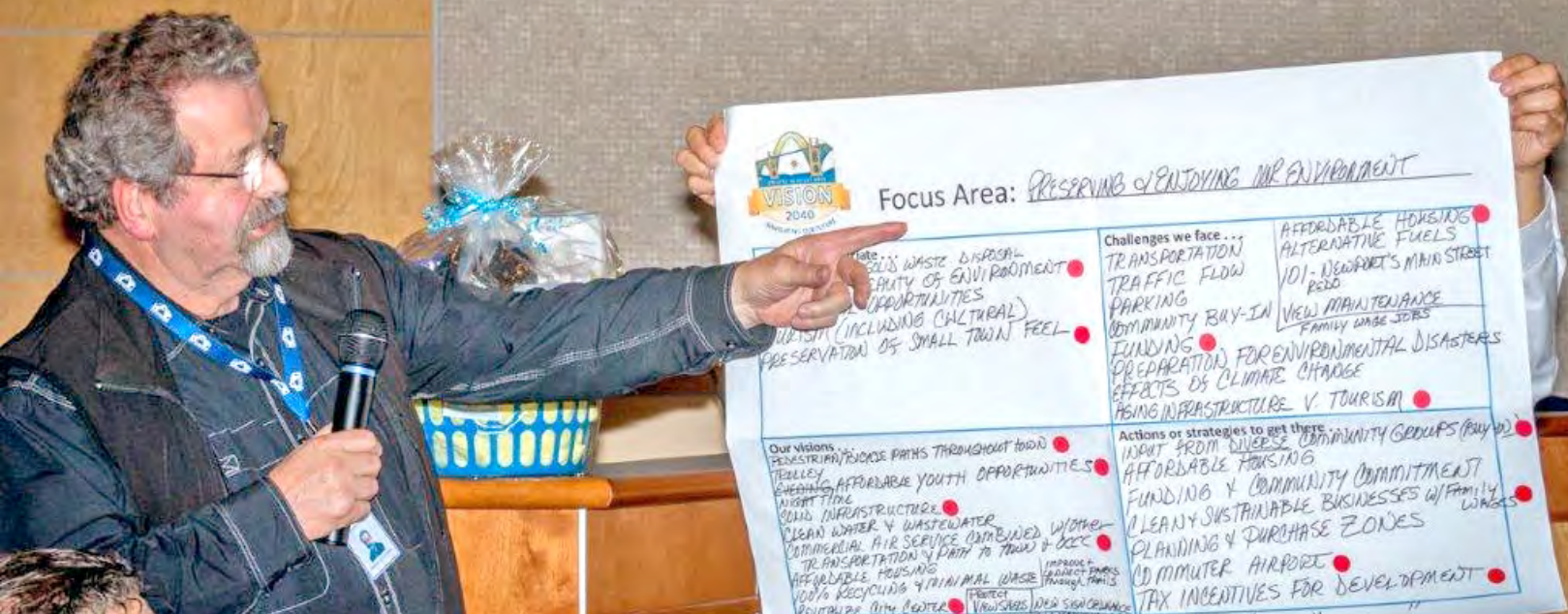
City of Newport's Vision 2040 Planning