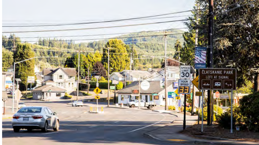
Clatskanie, Oregon's use of radar speed signs could be what the future looks like for traffic calming and traffic enforcement.

He added that residents appreciate the radar speed signs, too. "Everybody enjoyed it because they have all had the same big