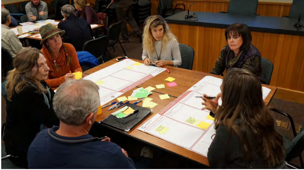
Bend Climate Action Planning

“All of our modeling was built off of real data from those stakeholders as well as input from the implementation stakeholders,” she said, adding tables were created to help stakeholders visualize the potential results of the actions.