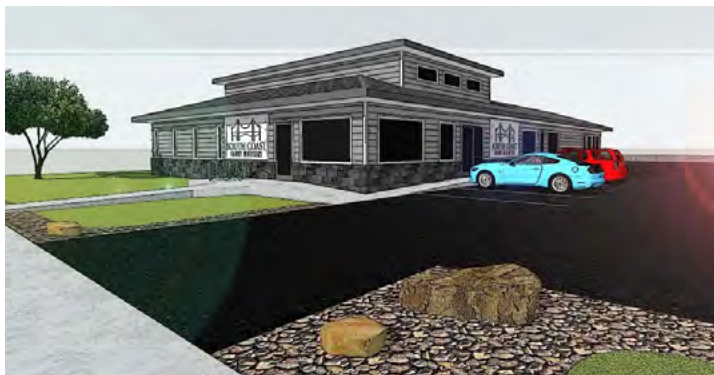
South Coast Dental Building - After