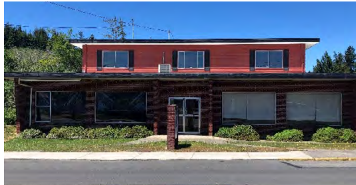
South Coast Dental Building - Before

In addition, the city is working on the Coos Bay Village Project, located along the North Bayshore Drive waterfront. The project will be comprised of multiple retail, restaurant and office buildings; pedestrian plazas; a public boardwalk; off-street parking; landscaping; and the installation of a lighted intersection.