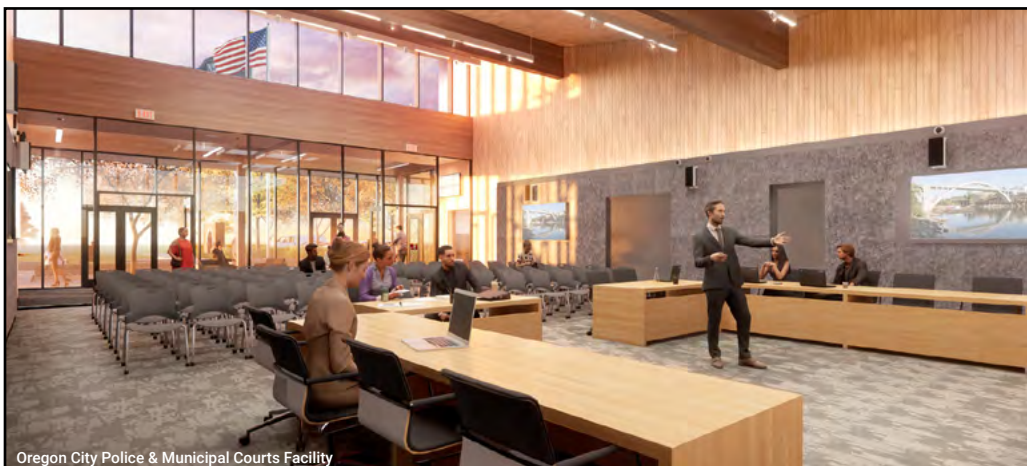
Oregon City Police & Municipal Courts Facility