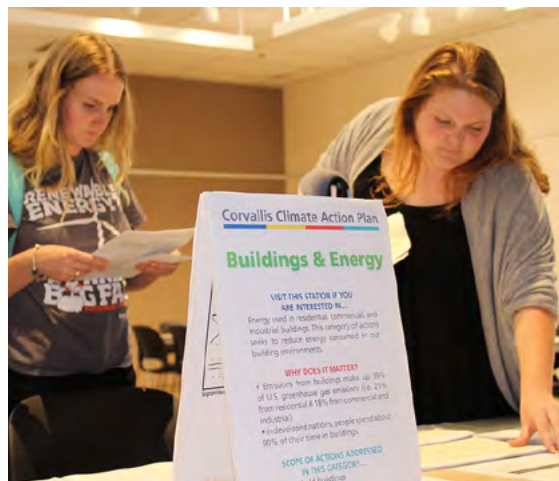
Left: Corvallis Climate Action Planning

“The one-year plan was a jumping off point and a way for the council to say, ‘We are committing to this and here are the five steps we are going to take to initiate this 30-year plan’ ”