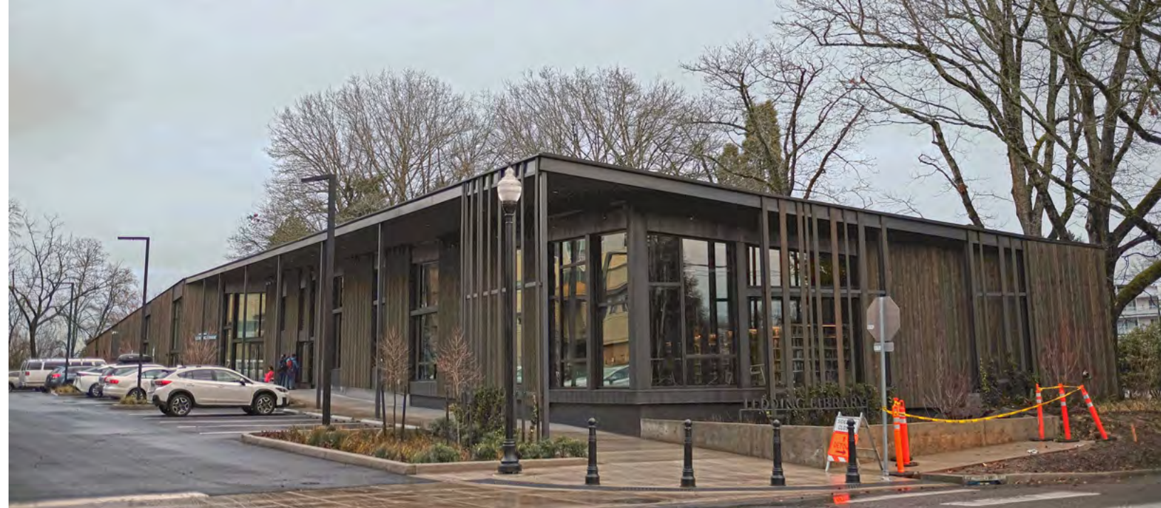
Milwaukie's new energy-efficient Ledding Library has a solar array, contributing to carbon-free energy generation in the city. Working with PGE, the city purchases 100% carbon-neutral operational electricity for city buildings and streetlights, as well as EV charging.